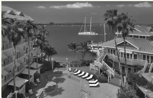
Live auction item Hyatt Key West Resort